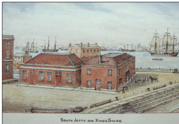
A depiction by H.K. of Portsmouth dockyard as in the early days of the nineteenth century.