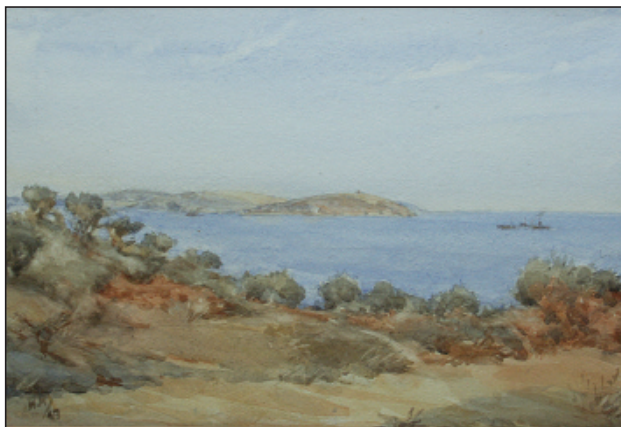
Falmouth Bay painted by H.K. in 1947 as a memento of his time at Falmouth 1940–1942 when it looked very different.