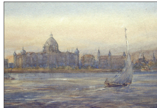
The waterfront, Bombay.